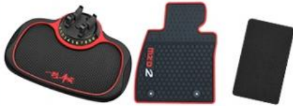
Large Dimension PVC product