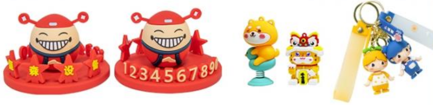
3D promotional product