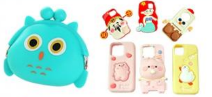
Silicone promotional product