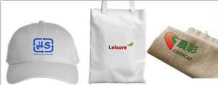
Silicone trademark heat transfer product