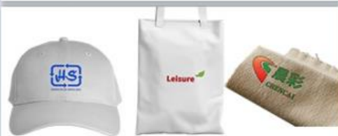
Silicone trademark heat transfer product