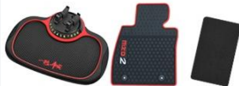
Large Dimension PVC product