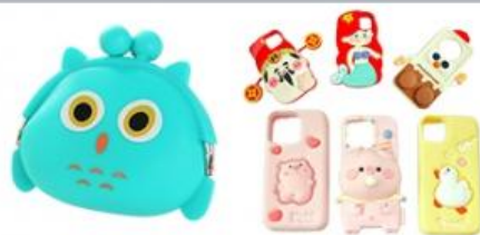
Silicone promotional product