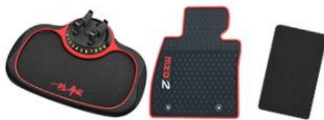
Large Dimension PVC product