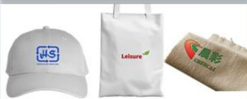
Silicone trademark heat transfer product