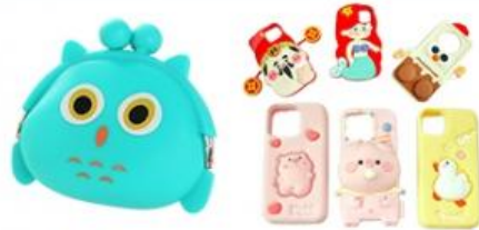
Silicone promotional product