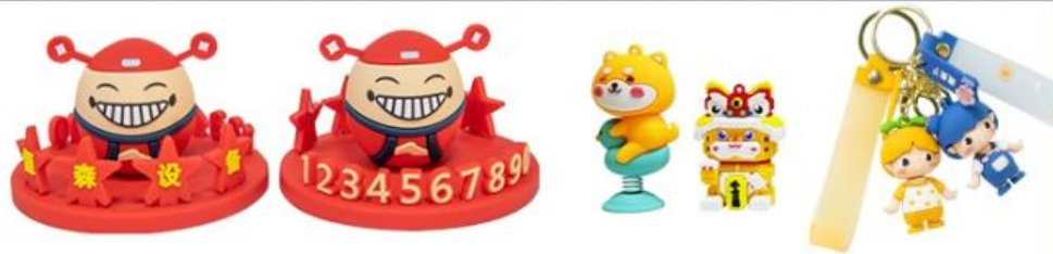
3D promotional product

If you have the need to produce a certain product, we can provide you with a total solution, please feel free to contact us!