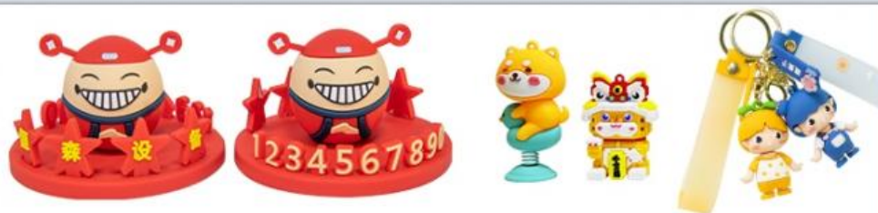
3D promotional product

Dongguan Chencal Automation Equipment Technology Co., Ltd