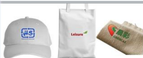
Silicone trademark heat transfer product