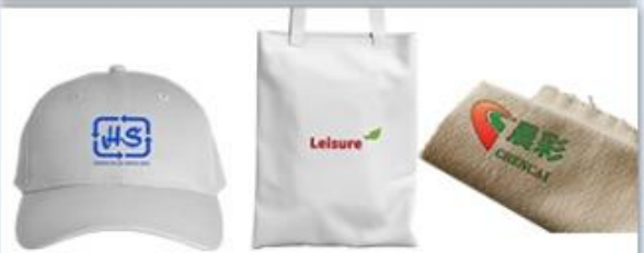
Silicone trademark heat transfer product