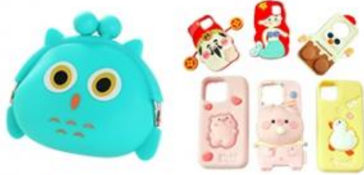
Silicone promotional product