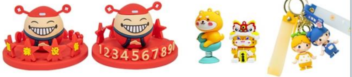
3D promotional product