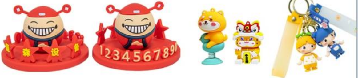
3D promotional product