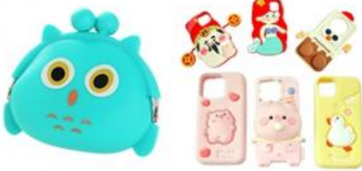
Silicone promotional product