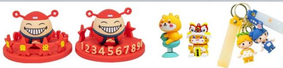
3D promotional product

Dongguan Chencal Automation Equipment Technology Co., Ltd