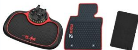
Large Dimension PVC product