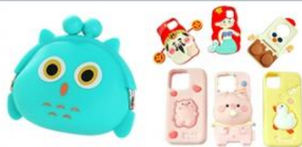
Silicone promotional product