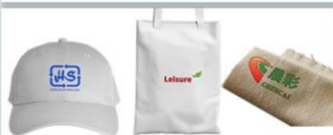
Silicone trademark heat transfer product