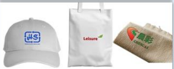
Silicone trademark heat transfer product