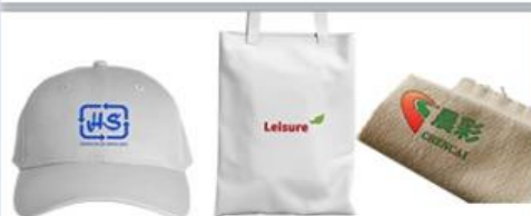
Silicone trademark heat transfer product