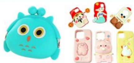
Silicone promotional product