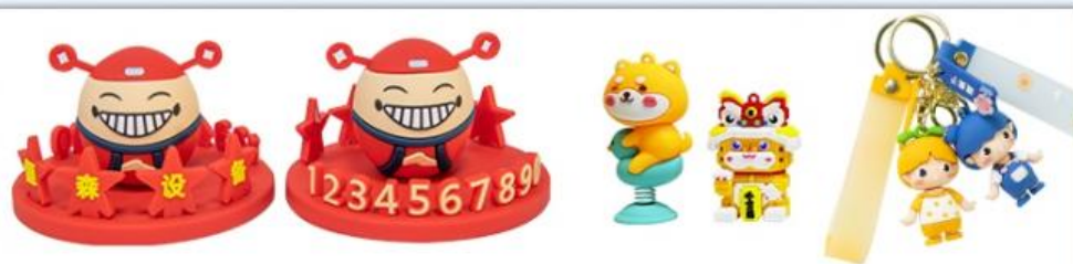
3D promotional product

Dongguan Chencal Automation Equipment Technology Co., Ltd