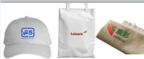
Silicone trademark heat transfer product