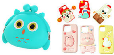
Silicone promotional product