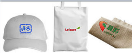
Silicone trademark heat transfer product