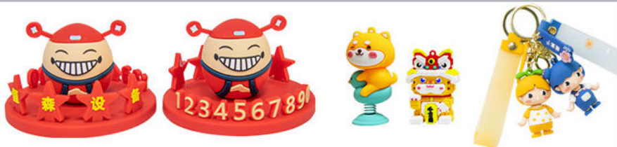
3D promotional product