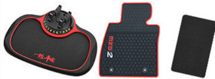
Large Dimension PVC product