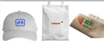
Silicone trademark heat transfer product