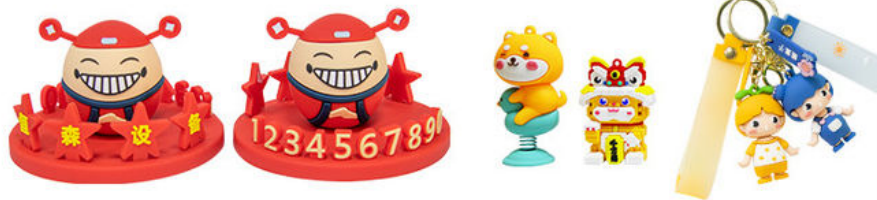
3D promotional product