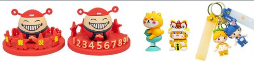
3D promotional product

Dongguan Chencal Automation Equipment Technology Co., Ltd