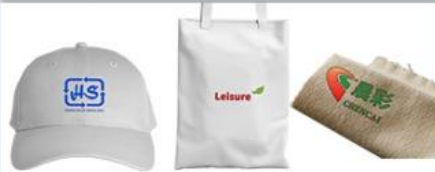
Silicone trademark heat transfer product