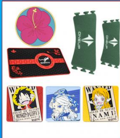
Flat mouse pad