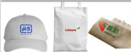
Silicone trademark heat transfer product