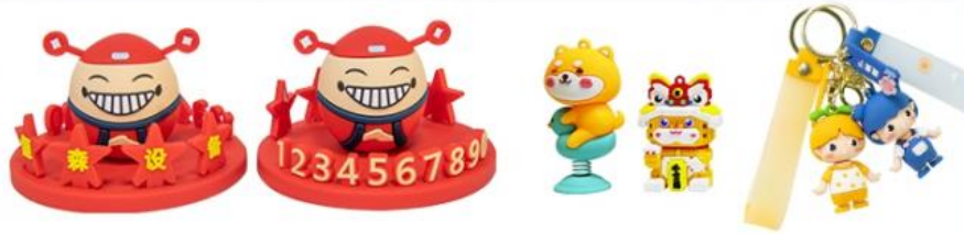
3D promotional product