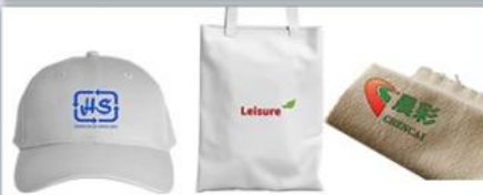
Silicone trademark heat transfer product