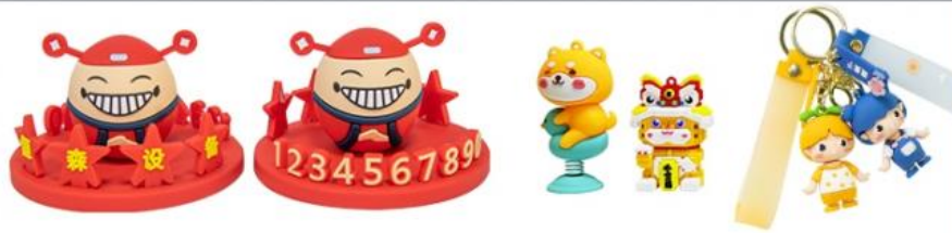
3D promotional product