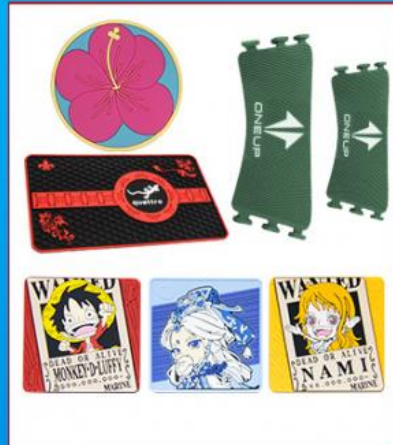
Flat mouse pad