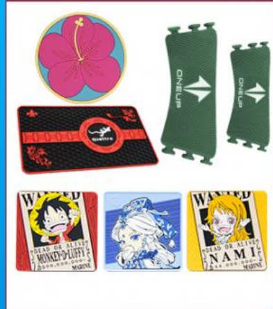
Flat mouse pad